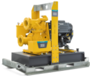
SKID02 PAS 200MF