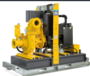
SKID02 PAS 150HF