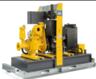
SKID02 PAS 100HF